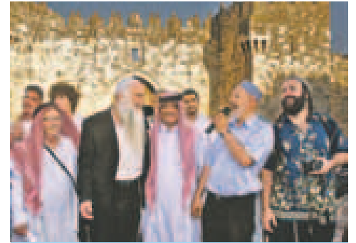
Jewish, Christian, Muslim and Druze men gather in Israel at the Garden of the Mothers Women's Peacebuilding Center (supported by CRT)

T he Center for Religious Tolerance (CRT) traces its roots to a trip to Israel during the second Palestinian Intifada (uprising). Newspapers were filled with stories of suicide bombings, and the travelers expected to find only hatred and violence. Instead, they met countless individuals of all faiths working to promote harmonious relationships in their communities. It quickly became clear that the peacemakers were isolated from each other, and that they felt ignored by the rest of the world. By the time they returned home, the travelers had decided they had to do something. CRT was developed with one major goal in mind: to find, support, and publicize effective interfaith grassroots peace efforts in areas of conflict.